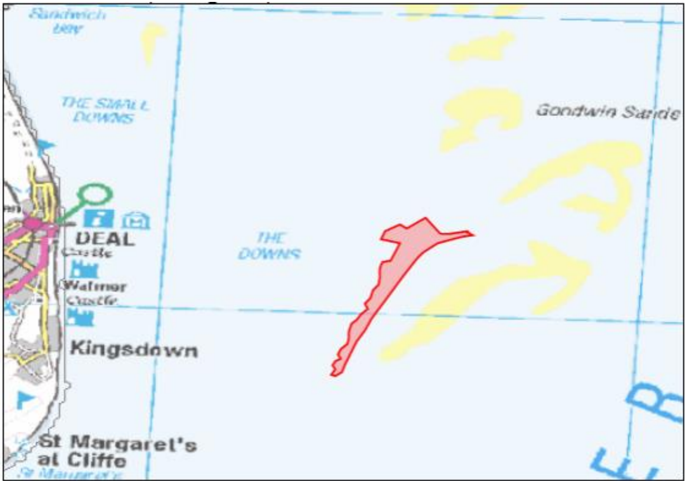
Figure 1: Proposed dredging location. Area 521 is highlighted in red.